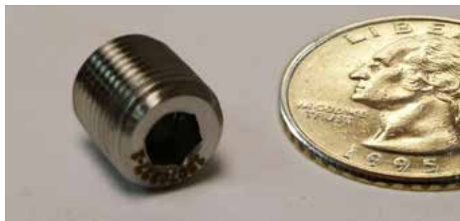
1/8 in (3mm) nominal size welded FRB assembly adjacent to a US 25 cent coin.